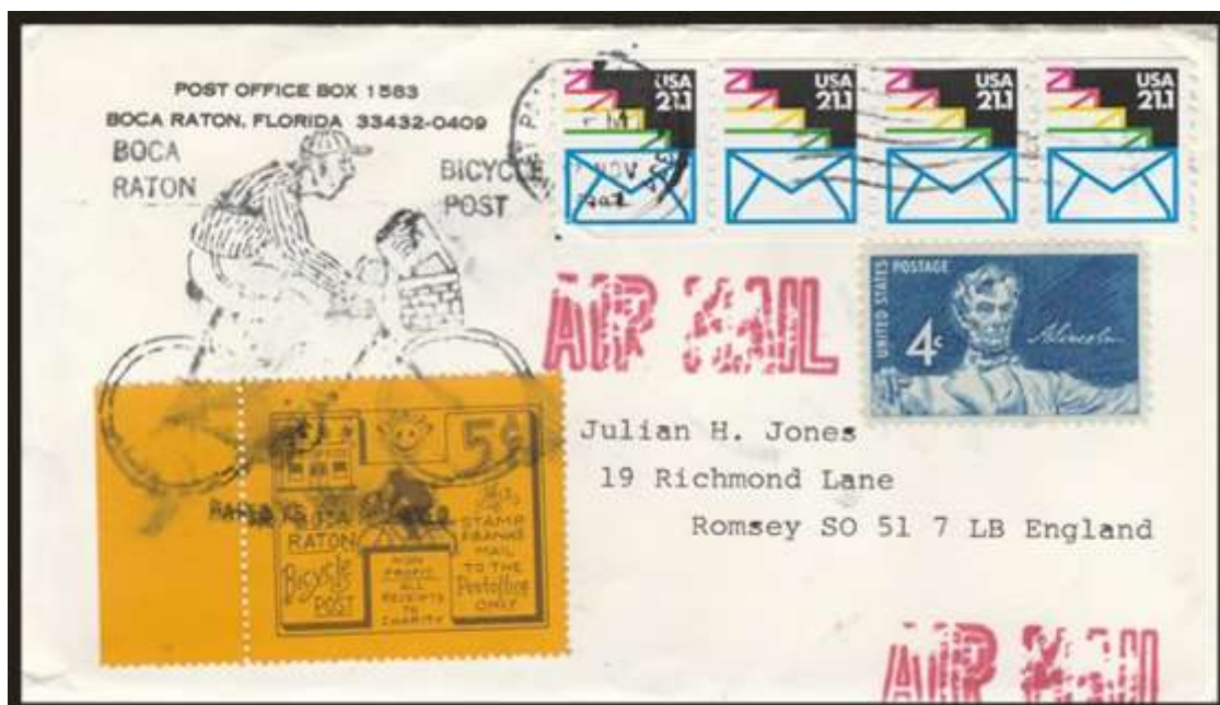
Boca Raton Bicycle Post, Boca Raton, Florida, to Romsey, England, 17th November 1987 Rate: US - GB air mail 44¢ per ½oz, effective 17th February 1985 to 2nd April 1988.

Initially Alfie only carried Pat's mail, but he was eventually allowed to carry mail from the Post Office to the front porch of a disabled neighbour.